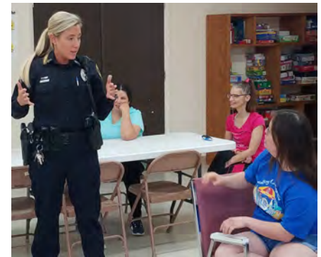
Officers from OPDD visited BASCA and introduced the "Take Me Home" program to the individuals and their families.